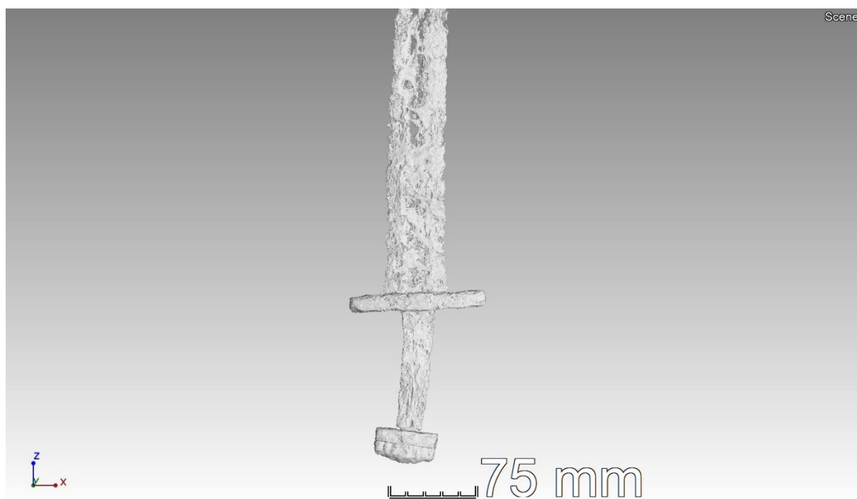
Figure S4. Varín sword. Frontal CT 3D image of the upper part (elaborated by author, photo by J. Šurka).