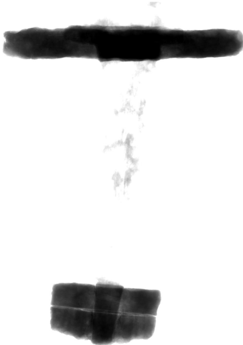
Figure S2. Varín sword. Frontal X-ray CT image of the hilt (elaborated by author).